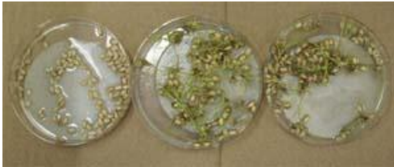
(not transformed) (npt II gene introduced)