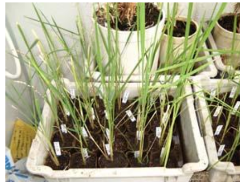
Fig4. Next generation (T1) individual