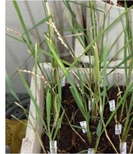
Fig2. Fertilizable transformed plant